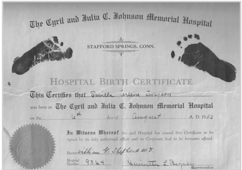
Birth Certificate (Connecticut, 1933)

The implementation of record-keeping laws varied by time and location, so there is no single place to search for or request records. Use resources like the Family Search Research Wiki to search for a location (county or state) and see when various records were kept. Visit familysearch.org , then click on Search and Research Wiki to get started.