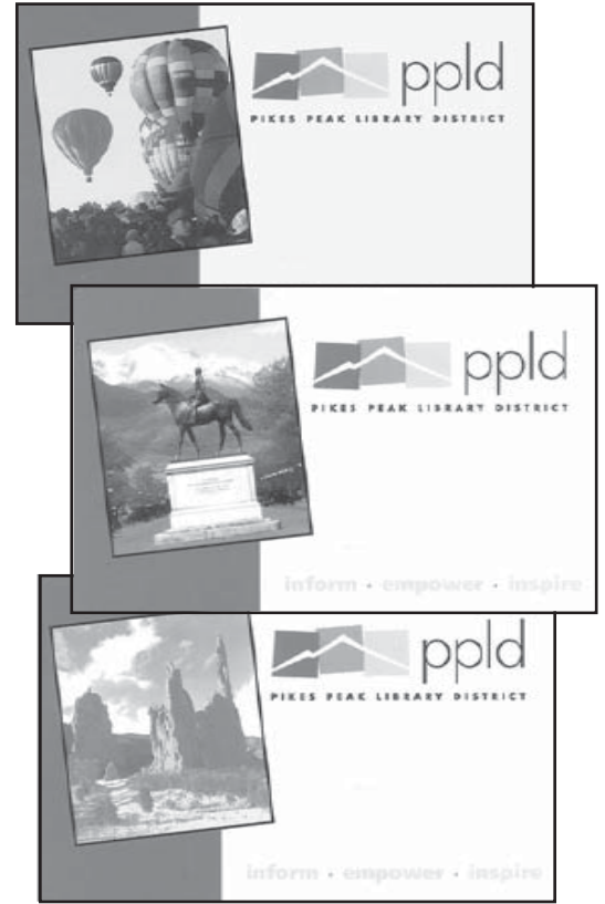
Library cards feature these photographs from the collection.