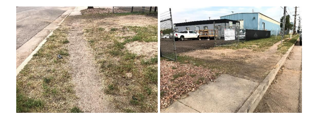
Figure 4. Poor Provision of Street Improvements for Vehicles