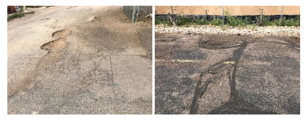
Figure 10. Deteriorated Pavement, Curb, and Sidewalks

Inadequate infrastructure was observed throughout the Study Area, predominately in the form of deteriorated pavement, curbs, and sidewalks, shown in Figure 10 . Additionally, a portion of the Study Area along South Sierra Madre Street is missing a sidewalk, shown in Figure 11 .