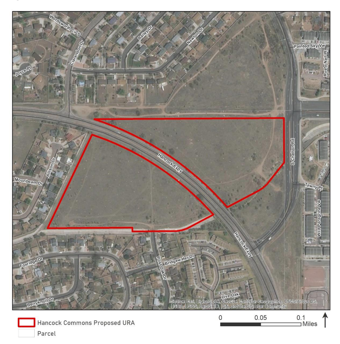
Figure 1. Hancock Commons Urban Renewal Plan Area