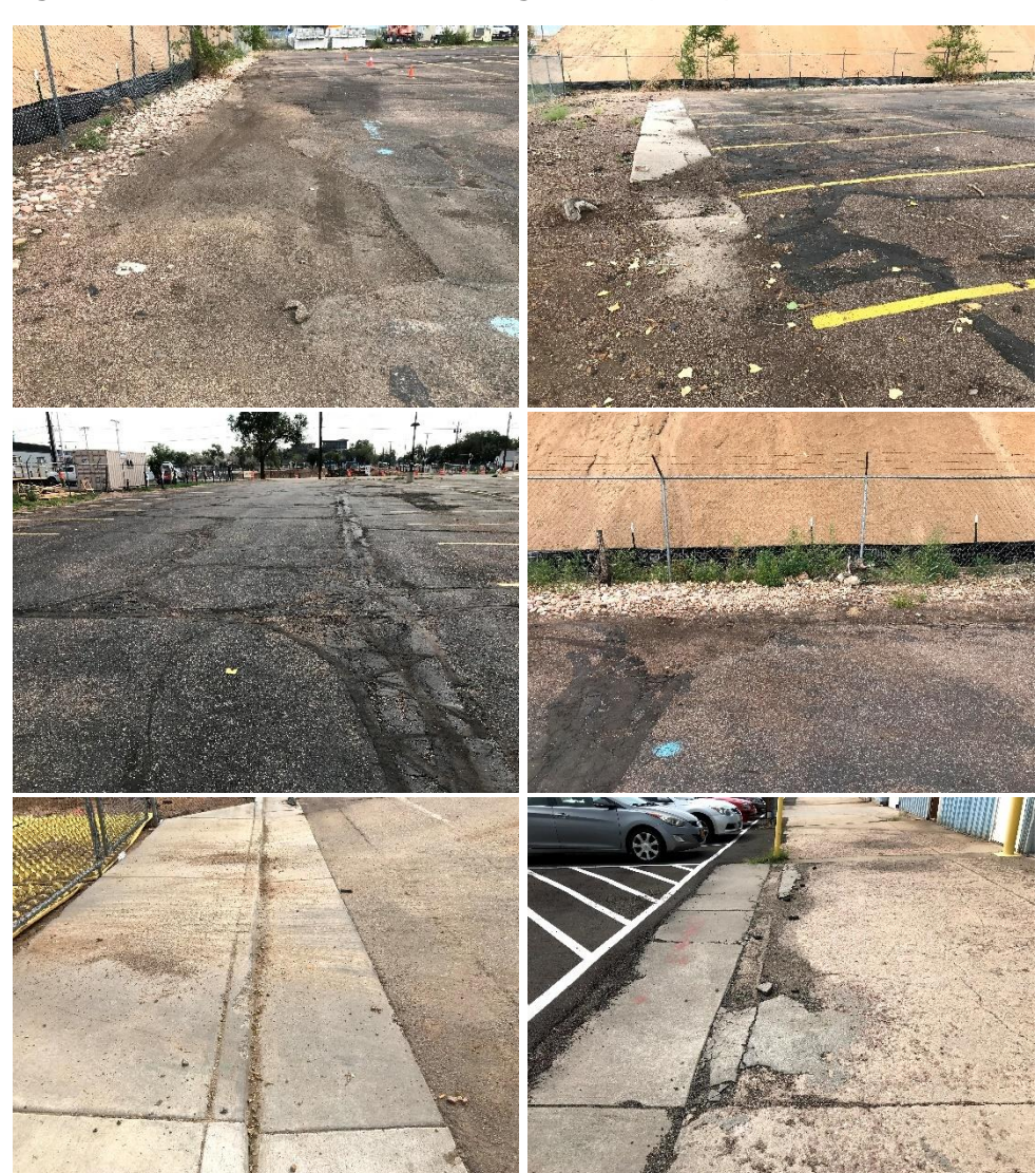
Figure 8. Deteriorated On-Site Parking Surfaces, Curb, & Sidewalks

4. Site Improvements: deterioration of site or other improvements Deteriorated site improvements observed include deteriorated on-site parking surfaces, curb, and sidewalks, shown in Figure 8. The parking lot on parcle 8 has cracked pavement and potholes. Additionally, cracked sidewalks were observed along South Sierra Madre Street adjacent to parcle 3 and deteriorated curb was observed along West Rio Grande Street. Overgrown vegetation was observed thorughout the Study Area, shown in Figure 9.