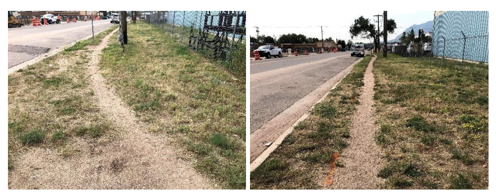
Figure 3. Poor Provision of Street Improvements for Pedestrians

Along South Sierra Madre Street on parcel 6 in the Study Area, poor provisions of street improvements for pedestrians were observed in the form of lack of sidewalks, shown in Figure 3. Throughout this portion of the Study Area, provisions of walkways for pedestrians were missing and an informal dirt path shows evidence of pedestrian use. There is a curb, but not a paved sidewalk to connect to the sidewalks along parcels 3 and 8. This is a disconnect in the existing pedestrian network on adjacent properties. Additionally, poor provisions of street improvements for vehicles were observed in the form of potholes and cracked pavement throughout the study area, shown below in Figure 4 .