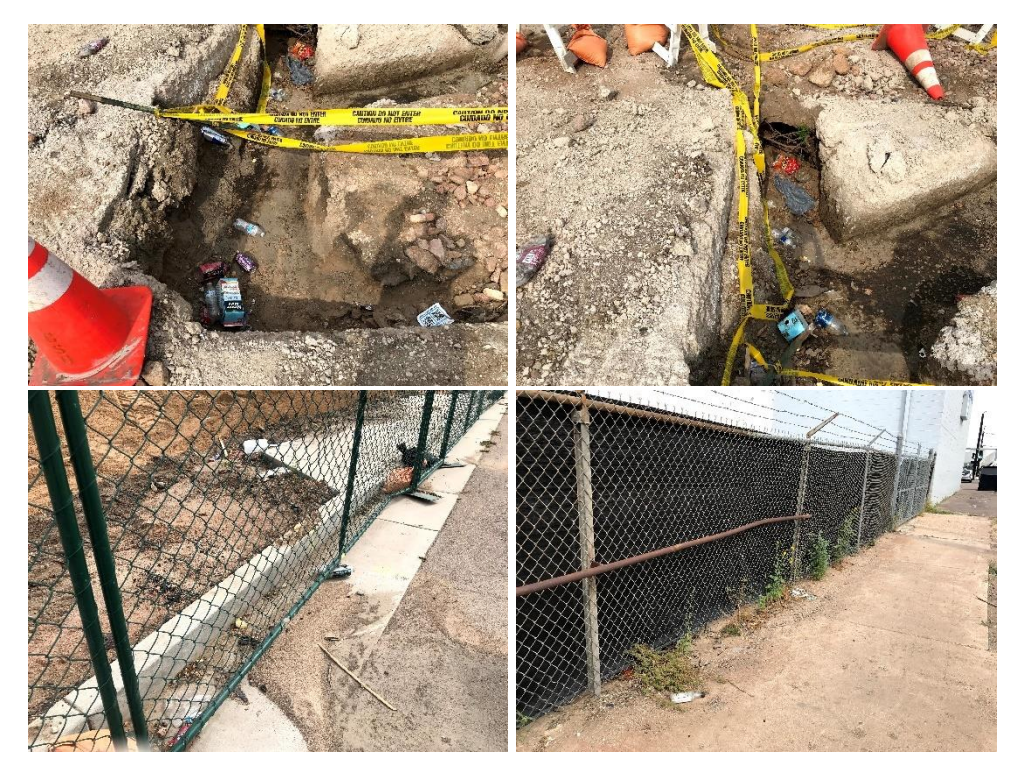
Figure 7. Vandalism/Graffiti