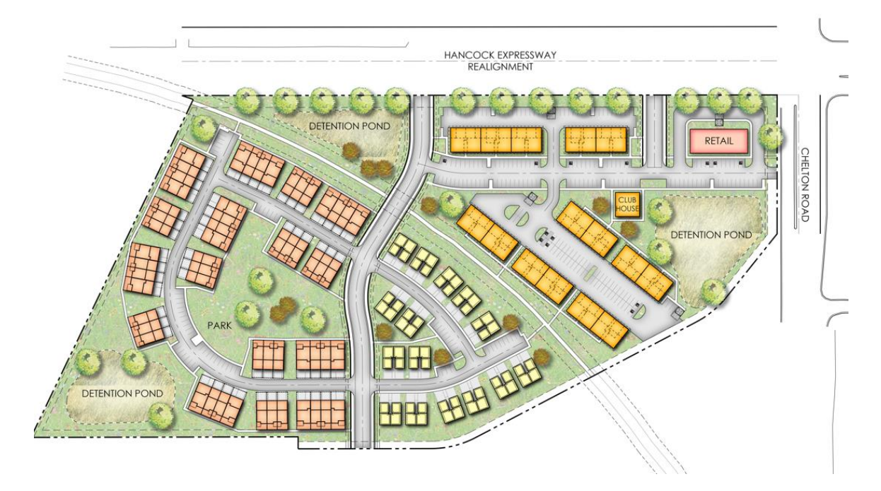
Figure 2. Hancock Commons Site Plan