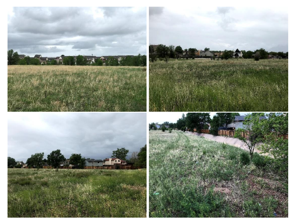
Figure 6. Vacant Property in Generally Urbanized Area

4. Vacancy: the existence of health, safety, or wellfare factors requiring high levels of municipal services or substantial physical underutilization or vacacy of sites, buildings, or other improvements. The entire 18.59-acre Study Area is vacant with no builing improvements. The Study Area is surrounded by residential development, shown in Figure 6, with single family detached homes to the north, west, and south of the property. Additionally, to the east of Chelton Road are townhome units. This area in southeast Colorado Springs and near the ariport is largely developed and prodominantly residential.