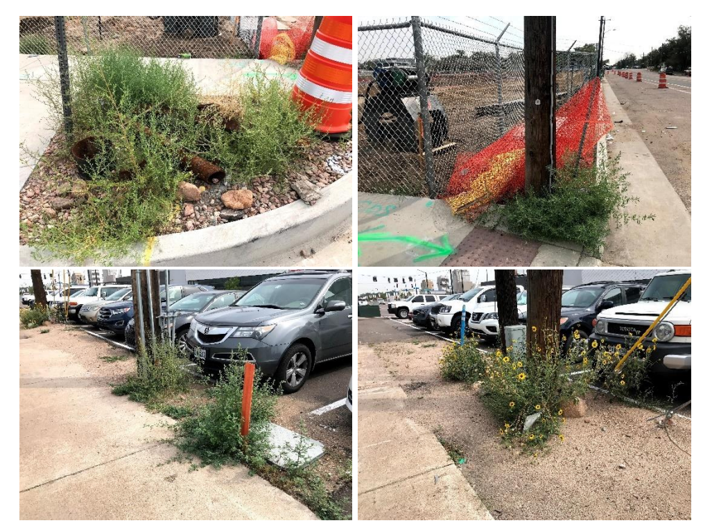
Figure 9. Overgrown Vegetation