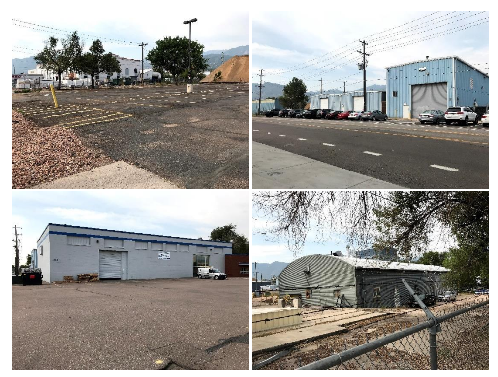
Figure 12. Undeveloped/Underdeveloped Parcels in a Generally Urbanized Area