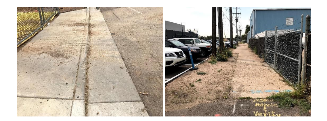
Figure 11. Lack of Sidewalks