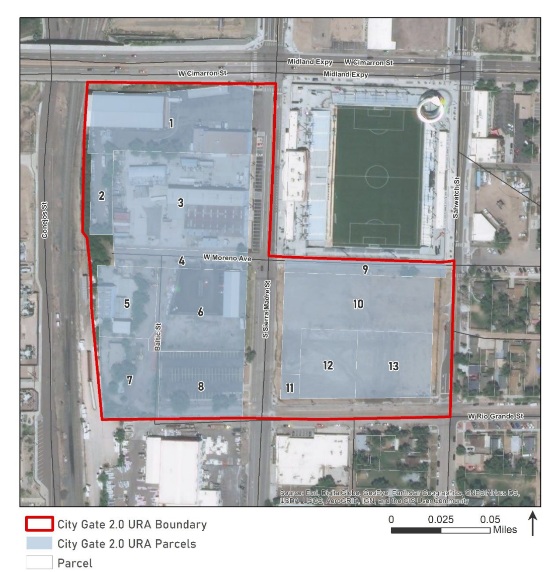
Figure 1. City Gate 2.0 URA Boundary

The City Gate 2.0 Urban Renewal Area ("URA" or "Plan Area") is located in the City of Colorado Springs in El Paso County. The Plan Area is comprised of three blocks in downtown Colorado Springs, generally south of Cimarron Street and west of Sahwatch Street. As shown below in Figure 1 , the plan area wraps around the recently constructed Switchback Stadium, which is located at the corner of Cimarron and Sahwatch Streets.