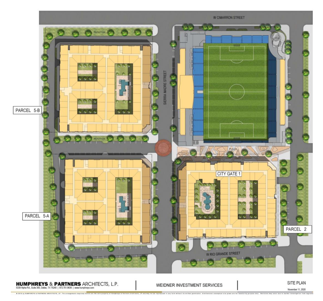
Figure 3. City Gate Phase 1 Rendering