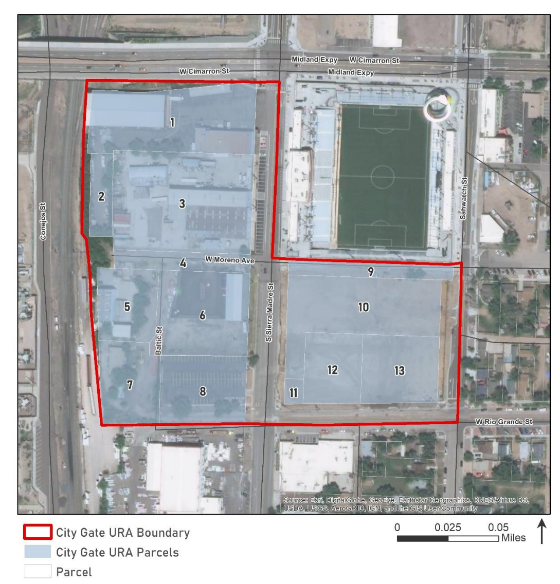
Figure 1. City Gate Proposed URA Boundary and Parcels