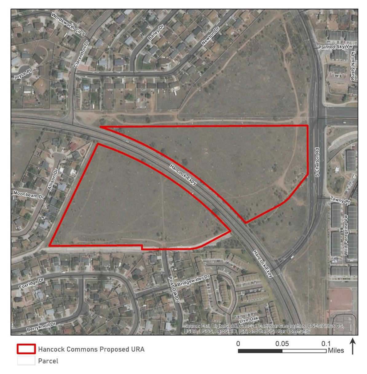
Figure 1. Hancock Commons Proposed URA Boundary and Parcels