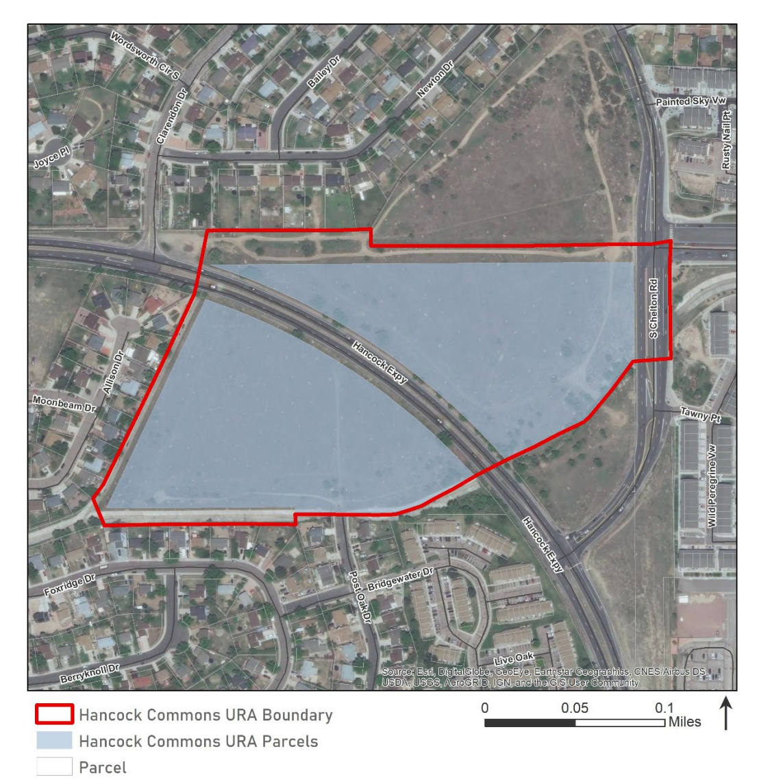
Figure 1. Hancock Commons URA Boundary

The Hancock Commons Urban Renewal Area ("URA" or "Plan Area") is located in the City of Colorado Springs in El Paso County. The Plan Area is comprised of one parcel, currently divided by Hancock Expressway, on approximately 18.59 acres of land and adjacent right of way. The boundaries of the Plan Area include a portion of Hancock Expressway that divides the parcel and Chelton Road to the east as illustrated in red below in Figure 1 .