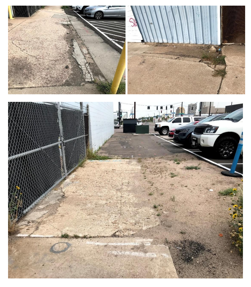
Figure 5. Cracked or Uneven Surfaces for Pedestrians