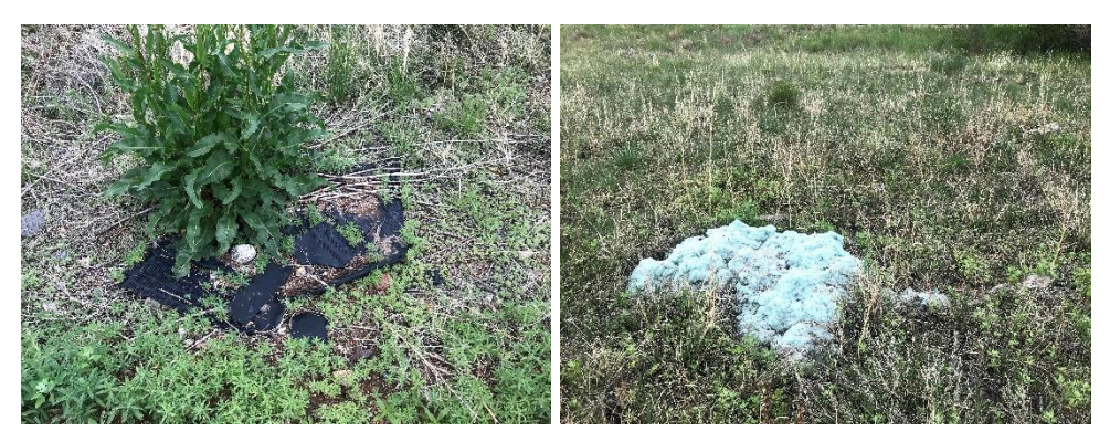
Figure 3. Excessive Litter

Throughout the Study Area unsafe and unsanitary conditions were documented. Excessive litter was observed and documented thoughout the property and was especially apparent along Hancock Expressway, shown in Figure 3 . The litter obesrved was more than just typical highway litter (food wrappers and drink containters) and included rubber car mats, foam insulation, blankets, cardboard boxes, and plywood. The Study Area is also in a floodplain and is prone to flooding due to the inadequate drainage system under Hancock Expressway, shown below in Figure 5 .