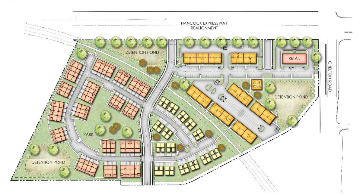
Figure 2. Hancock Commons Site Plan

Infrastructure improvements are a significant component of the development plan. Hancock Expressway will be re-routed and aligned along the north edge of the property. This realignment improves the street network and connectivity to the surrounding neighborhoods and will include an updated drainage system with a gravity sewer to serve the development on site.