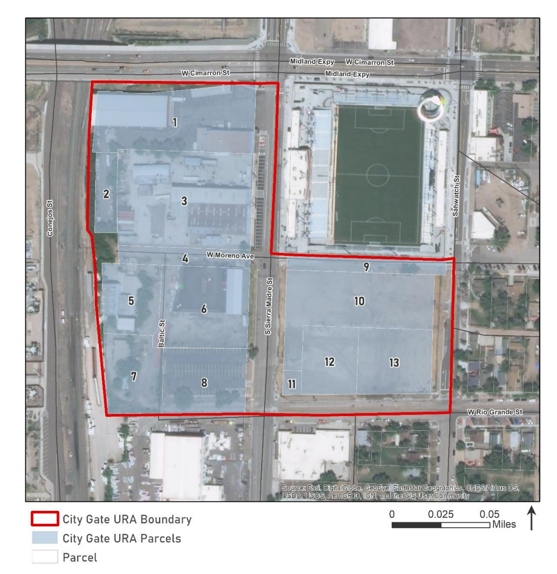
Figure 1. City Gate Urban Renewal Plan Area