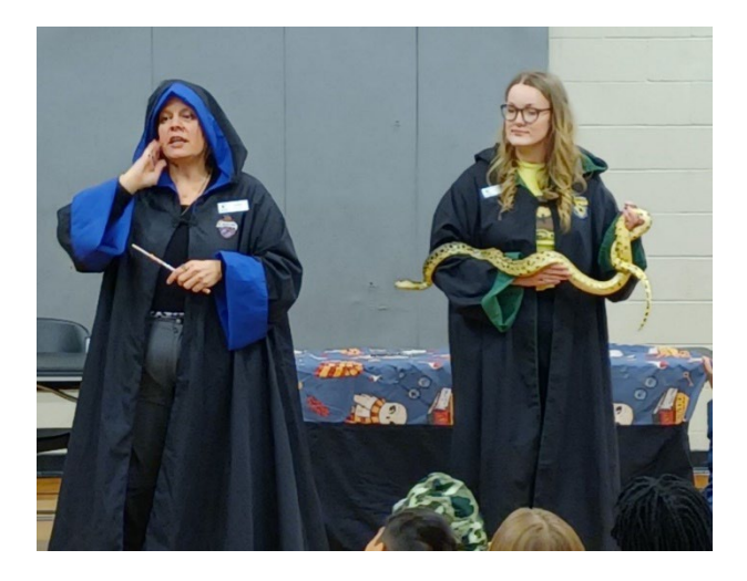
Nature's Educators Animals of Wizarding World