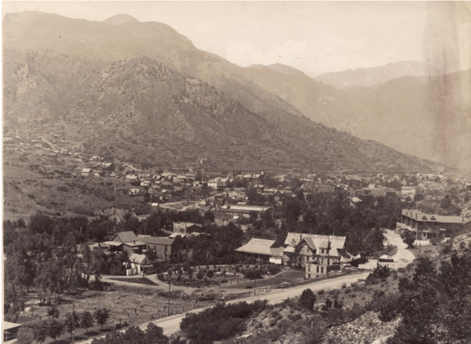
Manitou Springs ca. 1901

Birth and death records are officially registered with the state of Colorado, not individual counties, starting in 1908. Compliance was often delayed.